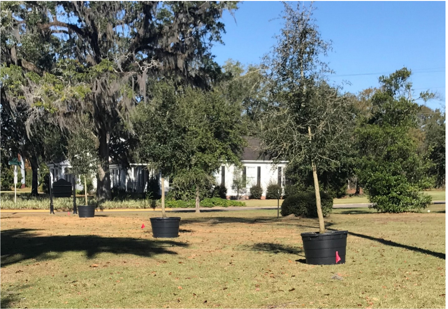
Posted by Carol Jones January 28, 2021