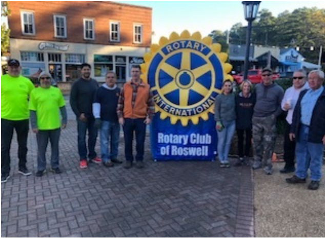
Posted by Trummie Patrick November 1, 2020