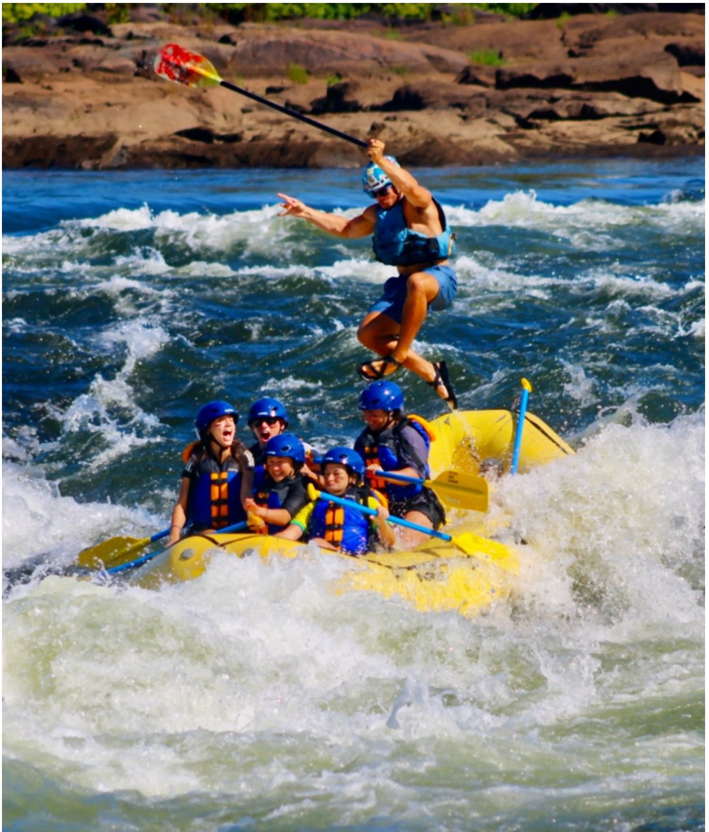
Posted by Katheryne Fields August 28, 2024