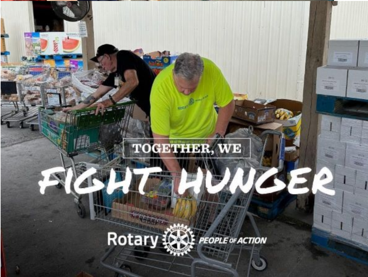
Posted by Amy Lemelin June 3, 2024